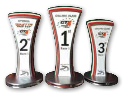
2014 Pro-Am, and Team Champions GT4 European Series